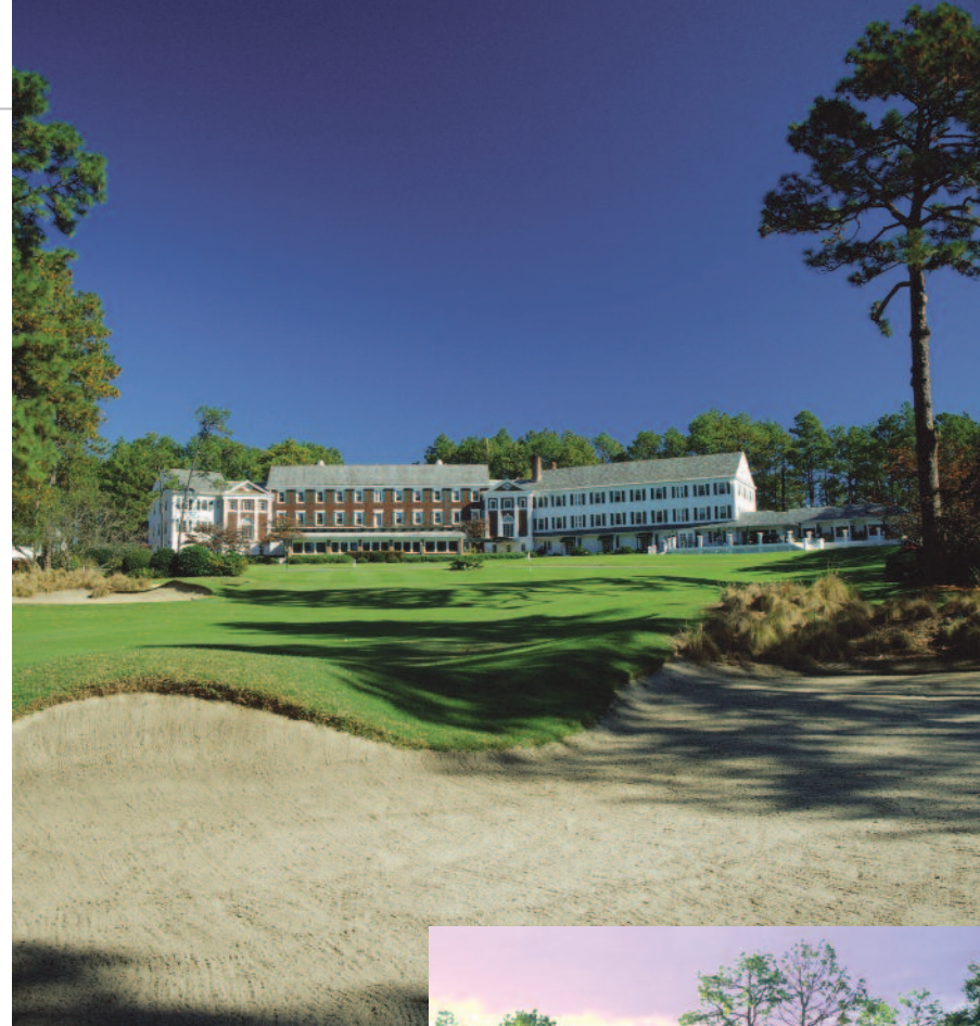
The challenging par-4 finishing hole at Mid Pines Inn & Golf Club provides a memorable conclusion to one's round.

The Sandhills of North Carolina are also home to Pine Needles Lodge & Golf Club and Mid Pines Inn & Golf Club, two top-notch golf resorts in Southern Pines. Mid Pines Inn & Golf Club opened in 1921 followed by Pine Needles Lodge & Golf Club