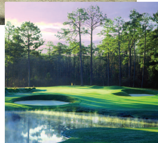
Pine Needles' signature par-3 third hole features a postage-stamp style putting surface.

In addition to the lodges and golf course, Pine Needles has an outdoor pool, indoor game room, lighted Wimbledon-style bentgrass tennis courts and practice facilities that include 80 hitting stations, four practice greens, five bunkers and a four-hole practice loop, which covers more than 20