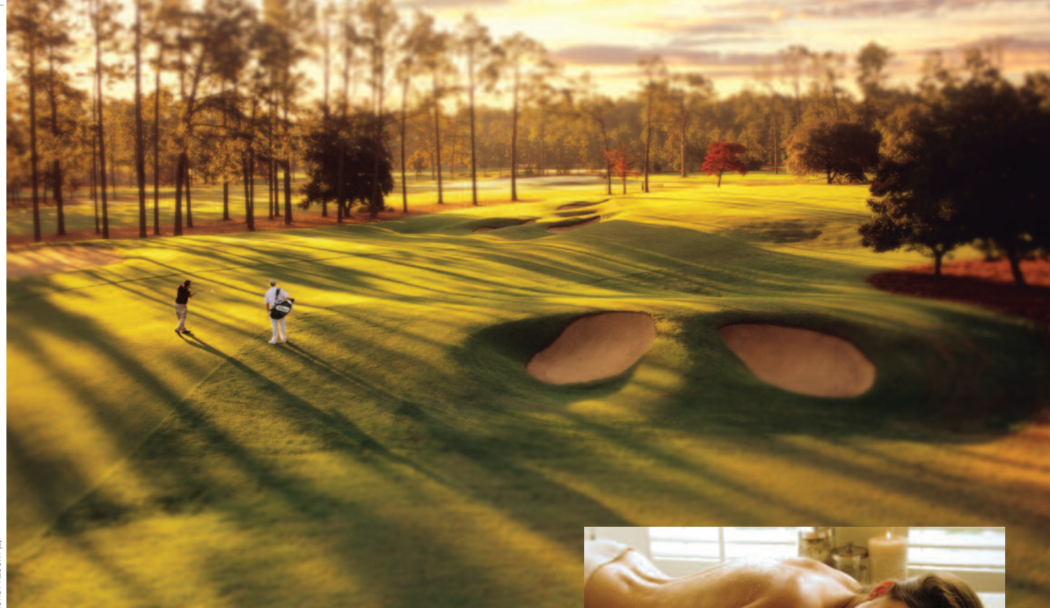
ABOVE: A variety of courses and golf schools at Pinehurst avail players a host of options to sharpen their game. RIGHT: Unwind at the spacious spa at Pinehurst.

as the U.S. Amateur, U.S. Senior Open and U.S. Women's Amateur championships, among others.