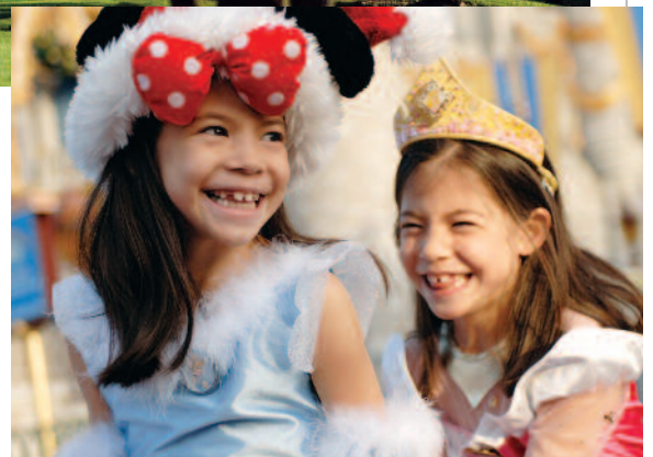
Disney’s theme parks put visitors in a cheerful – and refreshed – mood.

film, television and radio studio, as well as a 135-acre theme park. Don’t miss “The American Idol Experience,” “Toy Story Mania!” or the “Lights, Motor, Action! Extreme Stunt Show.”