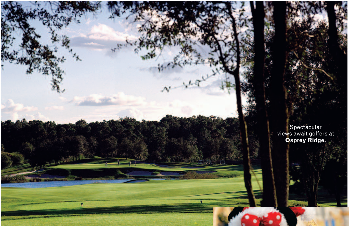
Spectacular views await golfers at Osprey Ridge.