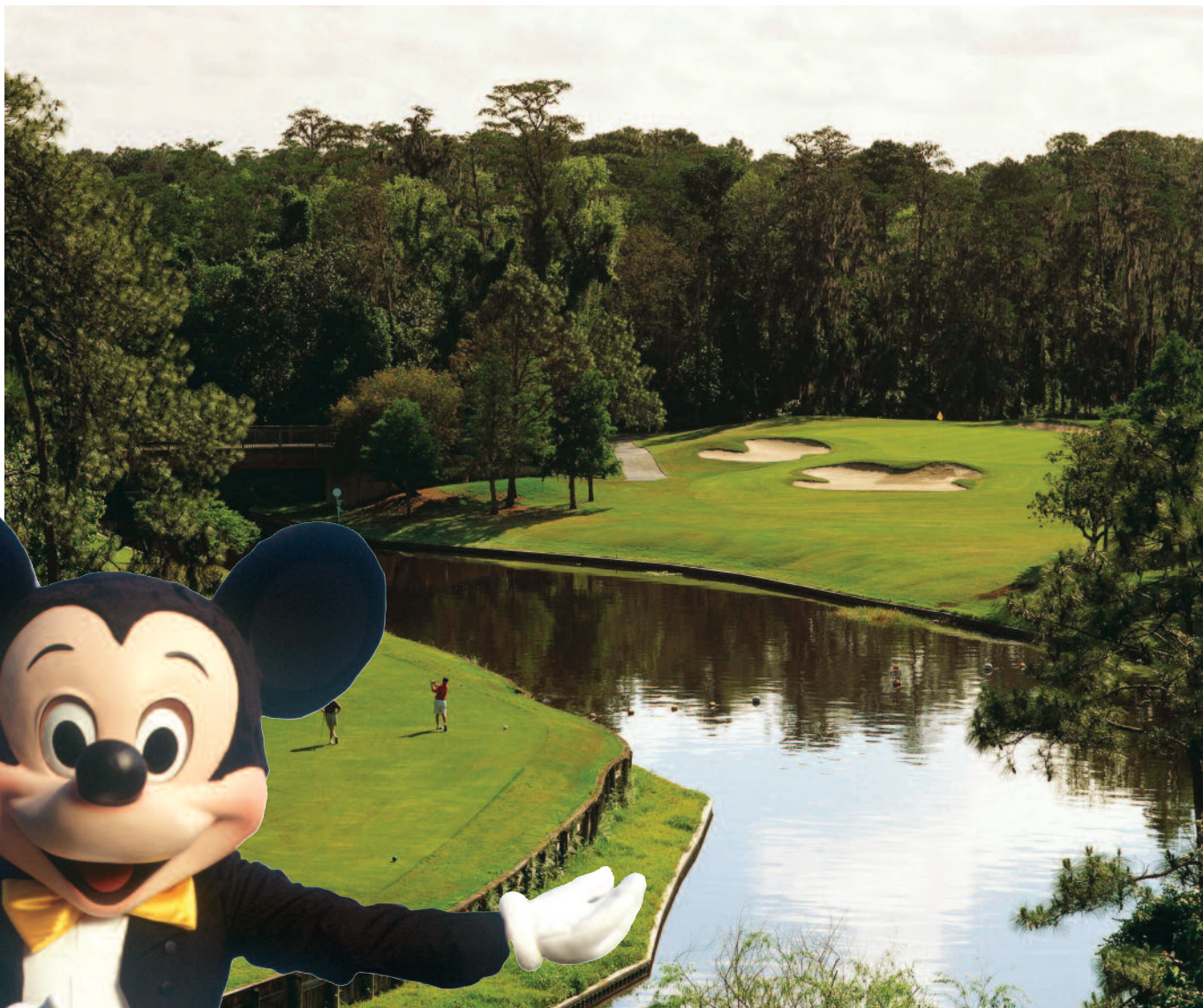
Mickey Mouse greets guests at Disney, a vacation classic where magical storybooks come alive. ABOVE: Lake Buena Vista is part of 99 holes of golf on five championship layouts.

G OLF ISN'T TOP-OF-MIND for most folks when they think of Walt Disney World Resort, but it should be. Since opening, the sprawling Florida-based resort has grown from a family fun spot offering a couple afternoons of golf to a world-class golf vacation destination with four championship-caliber courses.