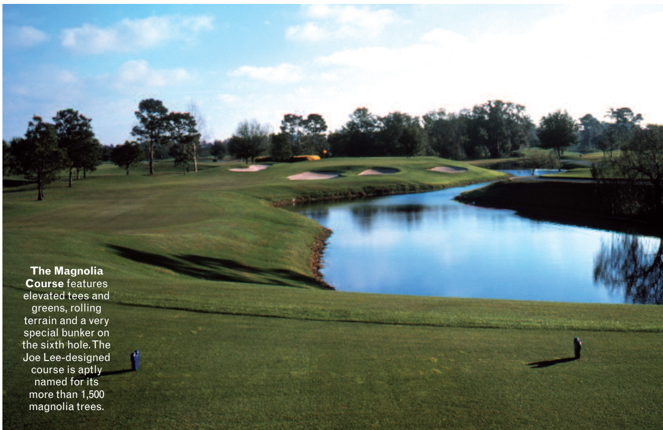
The Magnolia Course features elevated tees and greens, rolling terrain and a very special bunker on the sixth hole. The Joe Lee-designed course is aptly named for its more than 1,500 magnolia trees.

fect for a quick practice or a beginner golfer. “It’s a beautiful walk,” Weickel says. “You’ll see lots of native birds. We even have flocks of wild turkey.”